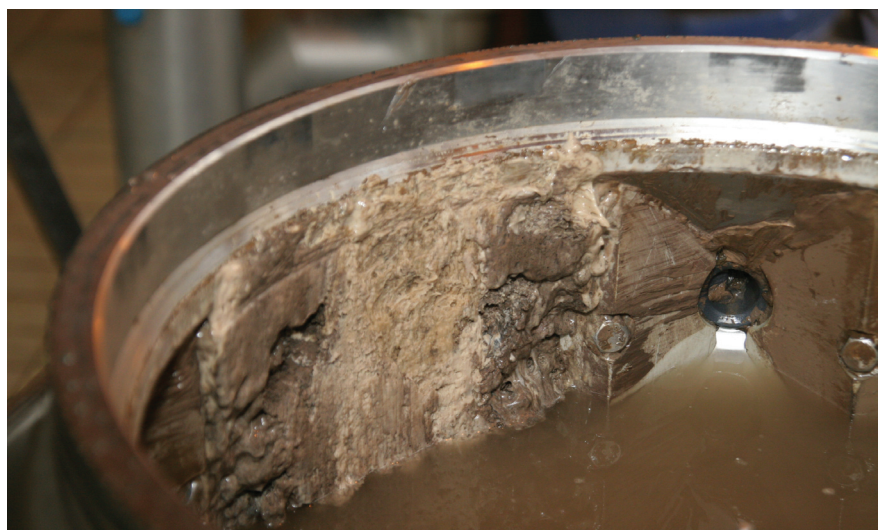
Clogged nozzles, jeopardizing the machine safety and calling for an opening of the machine for manual cleaning.