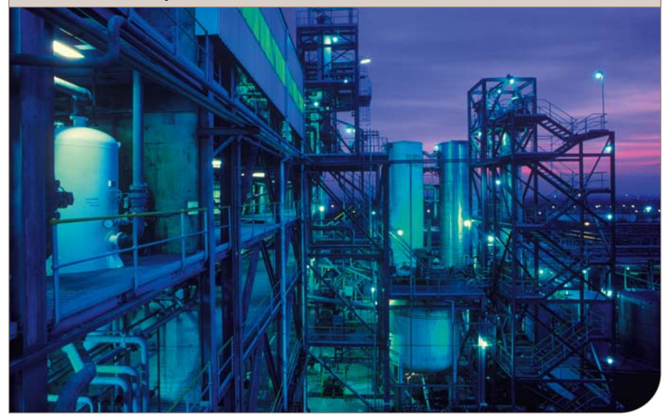
As this report from a US oil refinery shows, due to their self-cleaning effect, spiral heat exchangers from Alfa Laval can virtually eliminate heat exchanger fouling in critical refinery processes.

A major US refinery was experiencing severe fouling and plugging problems in two shell-and-tube (S&T) heat exchangers installed to cool desalter effluent using cooling water. In 2008, on Alfa Laval's recommendation, the refinery replaced the two S&Ts with a foulingresistant Spiral Heat Exchanger (SHE). The result exceeded expectations.